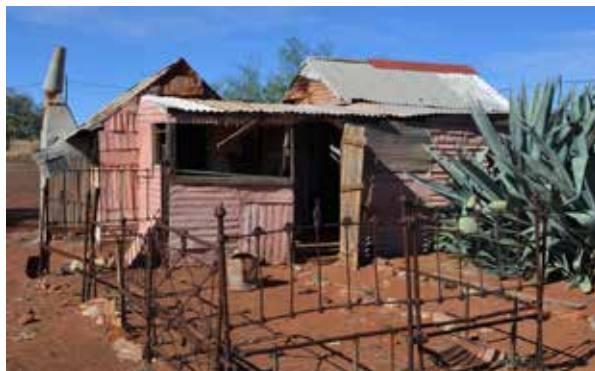
Little Pink Camp also known as the Pink House

We will keep you informed on the progress of work to both of these cottages.