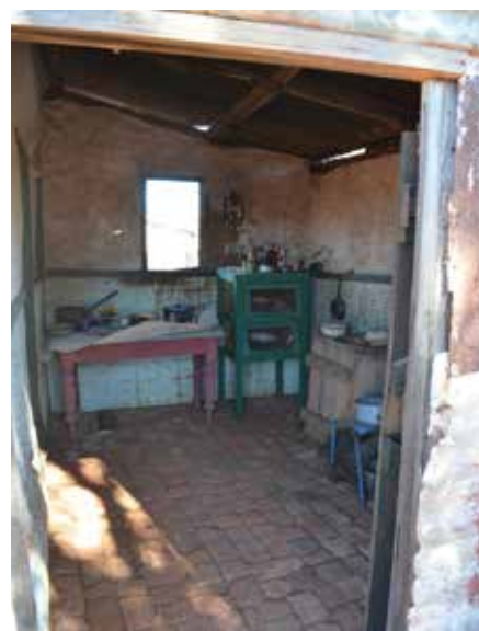
The kitchen in De Rubeis camp with pressed tin and hessian lined walls