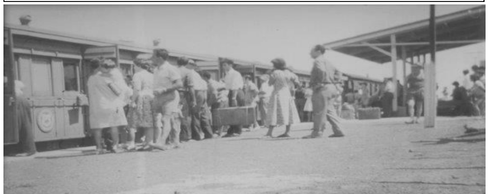
Departure from the Railway Station in December 1963, after the closure of the Mine.