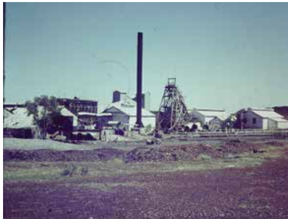
Sons of Gwalia Mine, c 1960

Former residents will have the opportunity to catch up with old friends and reminisce about the past. As a visitor, you will have the opportunity to wander through the living ghost town of Gwalia, peek into the cottages and imagine the lives of the people who dwelt in this once thriving community.