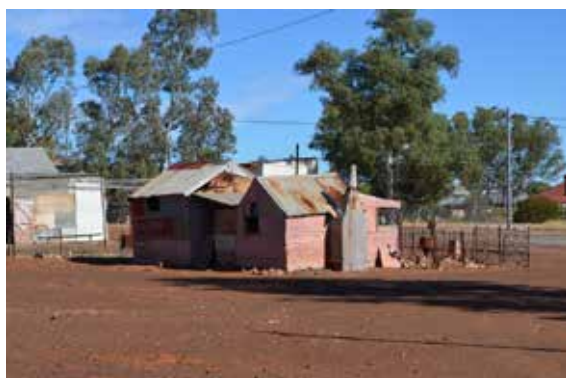
North East view of the Pink Camp