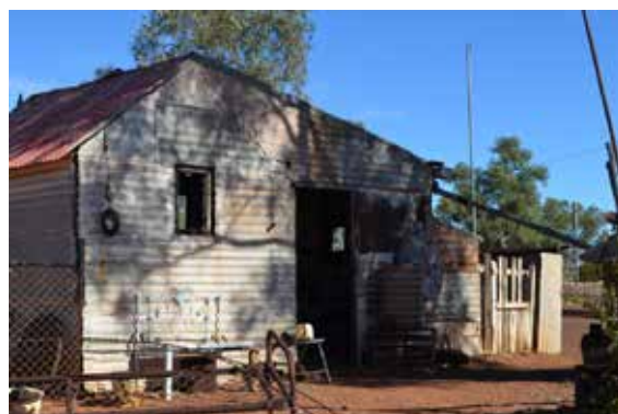
De Rubeis Camp