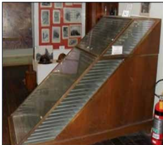
The timber, brass and glass mine level model is almost 7 feet long & 4 feet high

At the Industries Exhibitions Hall in Barrack-street, today, there will be displayed a glass model of the underground workings of the Sons of Gwalia Mine, near Leonora. After having been displayed in Perth, the model will be used on the mine for plotting future development work, particularly in relation to the new internal shaft, which will be commenced within two or three years No. 30 level.