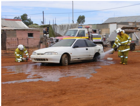
Leonora Fire Brigade demonstration