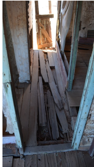
The passage in the Pink House before work started in August 2013