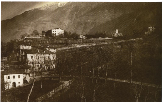
The village of Serino in c1900.

Thanks to a proxy selling, through letters from Sernio to Gwalia, Anita's grandparents bought the old Patroni house in Italy that dates from circa 1600.