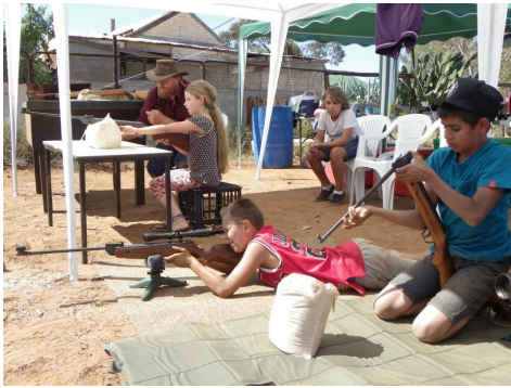
Children enjoying the air rifle activity