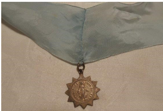
At Sunday Mass older Girls wore a Children of Mary Solidarity medal on a blue ribbon, a blue cloak over a white dress, and a net veil on their hair.

Parents bought everything. I don't remember there being a P&C and no Government funds were available for Catholic schools in those days. Sporting equipment was minimal, consisting of a few old tennis balls, one basketball, one softball and bat plus a few skipping ropes. We trained for the annual interschool sports, and on one occasion I came second in a race against Mt Margaret Mission kids, an error, I am sure, as I could not run well and they were all fast.