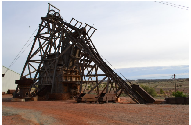
The Headframe in its current location is a well-known Gwalia landmark

Before any work on the headframe could commence, a geotechnical investigation was carried out recently to determine recommended foundation depth and systems. The investigations identified soil profile classifications, soil sampling, rock testing, ground water levels that would pose a problem to site access and construction of a new structural steel frame within the existing timber frame to provide support.