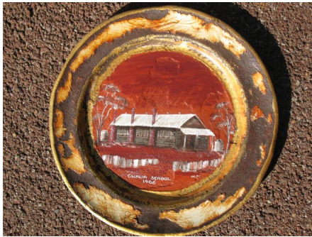
Gwalia State School c1906