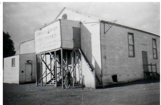
The AWU hall used as temporary school 1906. Photo taken in 1959