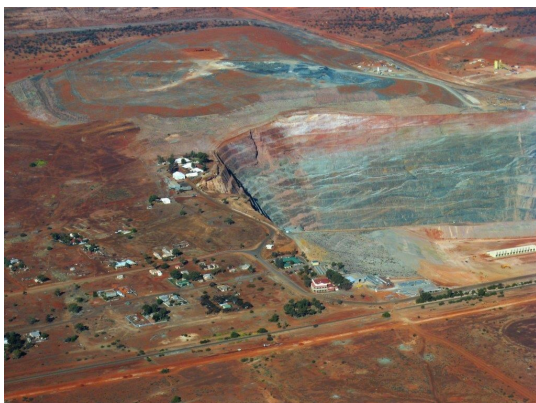
Gwalia ghost town & museum on the edge of the open cut mine.

Gwalia ghost town & museum is currently a hive of activity with a number of projects taking place at Gwalia. You can read all about it in this edition of the newsletter.