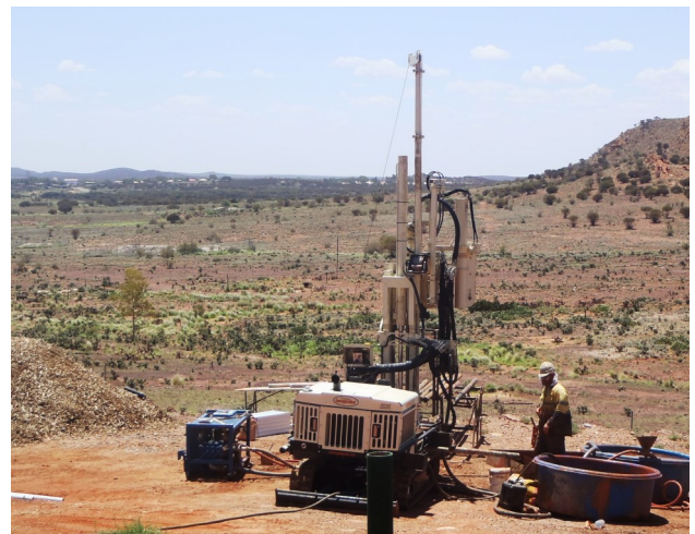
Workers from SGS Engineering Services drilling holes to conduct geotechnical investigations