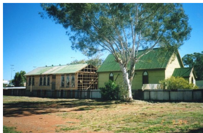
The relocated Central School behind the Christian Fellowship Church in Gwalia Street c2004 before it was demolished

happened and a suitable teacher's house was built next door by 1912. This school grew in numbers so that in 1916 the little corrugated iron school from Niagara was transported to the Gwalia campus. Both the teacher's house and the new school were of weatherboard with brick chimneys, quite a step up from hot corrugated iron buildings.