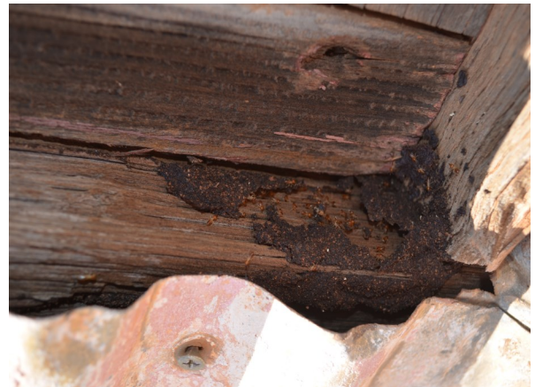
Active termites in a window frame at Major's Boarding House